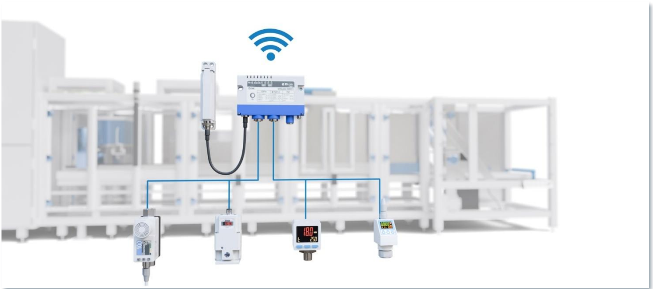
Wireless fieldbus system centralises information and enables communication over distances of up to 100 meters

Modern systems make this strategy easier than ever. Technologies like IO-Link, wireless communication and open protocols such as OPC UA mean integrating sensors into your existing set up is straightforward and cost-effective.