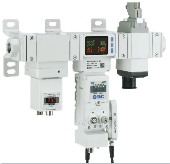
SMC's Air Management System – AMS 20/30/40/60 Series

We ultimately propose targeted equipment or system improvements, while supporting your team with training and ongoing optimisation to ensure long-term benefits. In short, we help you move from 'interesting data' to 'measurable results'.